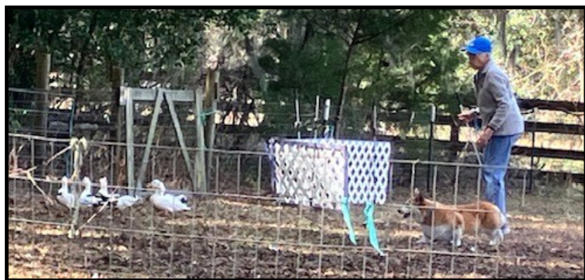
And they're off, herding ducks!