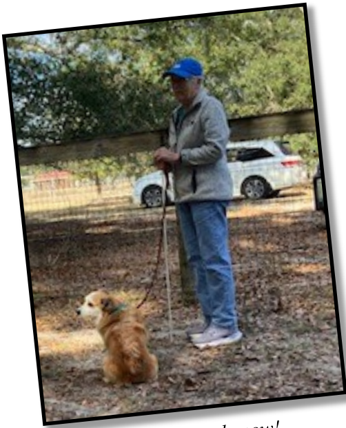
Getting ready now!